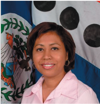
Ms. Zenaida Moya, Mayor of Belize City

Ms. Zenaida Moya, recently elected Mayor of Belize City, knows firsthand the struggles of the anti-corruption movement. A former high-ranking public official and formerly Vice-President of the Public Service Union of Belize, Ms. Moya was removed from her post after blowing the whistle on an alleged million dollar corruption scandal at Northern Fishermen Cooperative, supplier to the U.S. seafood restaurant chain Red Lobster. Ms. Moya will address today's closing plenary.