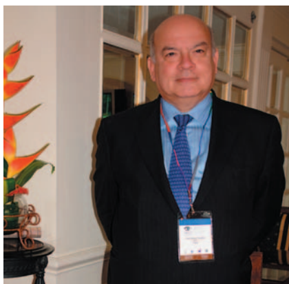
José Miguel Insulza, Secretary General of the Organization of American States

IACC Update (IU) spoke with José Miguel Insulza (JMI), Secretary General of the Organization of American States, following the IACC's opening plenary.